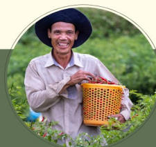
Farm Stress Management